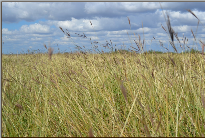
Left: OWB field during the growing season.

Some areas that are not invaded and may not be heavily populated with OWB can be potentially controlled if addressed early in establishment period. Landowners with low encroachment should focus on protecting the rangeland from further invasion. Preventative practices should be key in these areas. Practices such as cleaning of equipment and spot spraying with herbicide on roads where these grasses may be starting to establish are essential to maintain the current level of encroachment. Any mechanical disturbance on an area not heavily invaded by OWB that still has an abundance of native grasses and forbs could potentially spark a rapid invasion of these unwanted exotic grasses. It is important to note what the vegetation is comprised of before embarking on any disturbance to a rangeland.