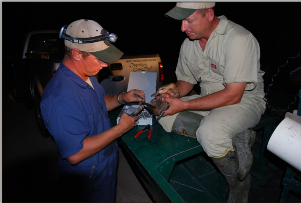
Banding a mottled duck.