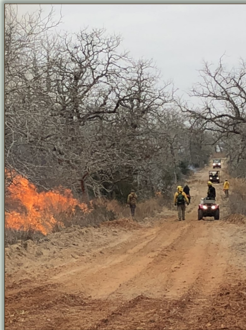
Prescribed burn efforts on private lands from District 7 staff. Top left and right: Photos©Clint Faas, TPWD. Left: Photo©Bobby Eichler, TPWD