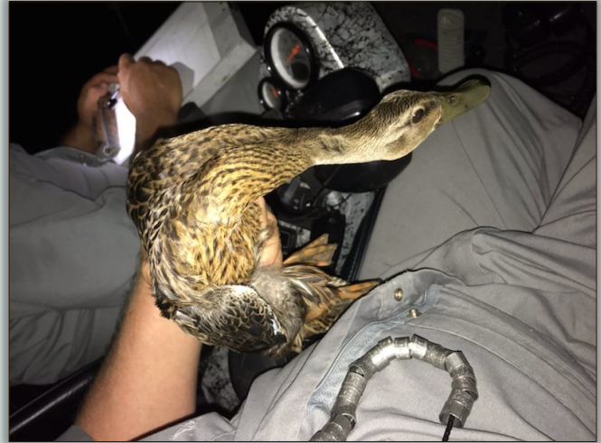
Mottled duck awaiting banding.

However, due to the above average rainfall that began in September, waterfowl habitats increased and spread these birds out across their southern wintering grounds making it a slow season. Only a few hunters got to experience some exceptional hunts around areas that attracted a multitude of migrating ducks looking for areas to dabble in. While most ducks are migratory, there is one duck that does not fly south for the winters or fly north for the summers; it stays in Texas year-round; it's the mottled duck ( Anas fulvigula ).