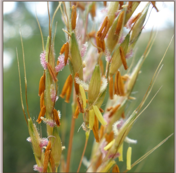
Indiangrass seed heads mature between Sept-Nov and make a stunning fall accent.