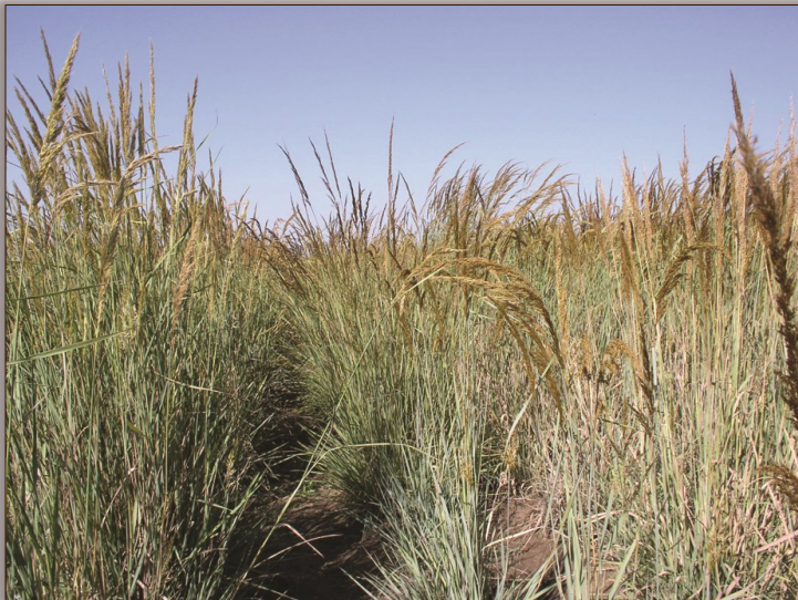
Only the best managed rangelands have significant stands of this nutritious grass.

Indiangrass, Sorghastrum nutans , is a perennial bunch grass that provides both cover and food for wildlife, and a valuable range indicator. It is a decreaser, meaning that with heavy grazing pressure it will decline. Only the best managed rangelands have significant stands of this nutritious grass. Indiangrass along with big bluestem ( Andropogon gerardii ), little bluestem ( Schizachyrium scoparium ) and switchgrass ( Panicum virgatum ) make up the four major grasses once found in the Tallgrass prairie that covered the central United States. Indiangrass will grow in a variety of soils including sandy and gravely disturbed sites but thrives best in rich bottomland areas with adequate moisture ranging from Canada to Mexico. It will survive periodic flooding but not prolonged saturation and thrives after being burned. The active growing period for this warm season grass starts in mid-spring, end of March to early May here in Texas. All warm season grasses like for the soil temperatures to be above 50 degrees Fahrenheit before germinating. It also makes a wonderful accent or ornamental grass for home landscaping. The clump will grow to about 1 ft in diameter and the blue green foliage remains about 3-4 ft until the fall when seed heads will shoot up. The plume-like seed heads have a metallic golden sheen sometimes turning a bronze color. These beautiful seed heads mature between September and November and make a stunning fall accent.